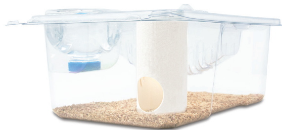
Image 3. The Innotube™ can either be placed vertically or horizontally in an Innocage®

To learn more about Innotube: www.innovive.com/mouse-cage-accessories.html