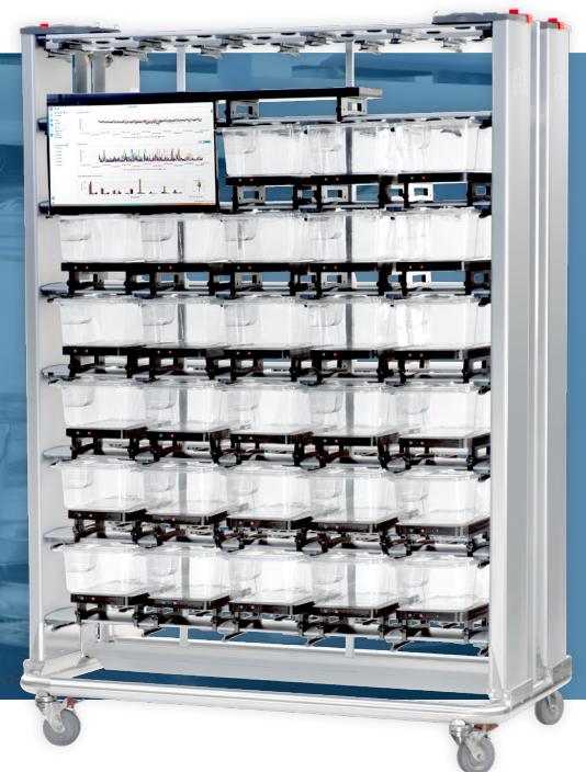
Image 1. Innorack® Home Cage Monitoring System with Matrix Plates and Optional Monitor