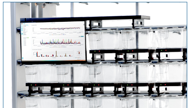
Image 2. Optional On-rack Monitor with Up-to-Date Reports